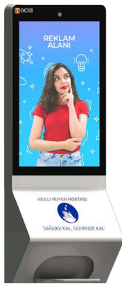
MOUNTED TO THE WALL